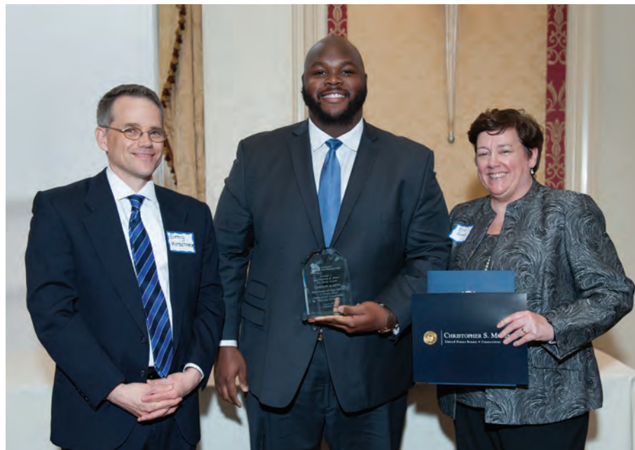
Gordon & Rees was honored with a Pro Bono award from the Center in 2017.

With special appreciation to the Yale Law School and its Mortgage Foreclosure Litigation Clinic: