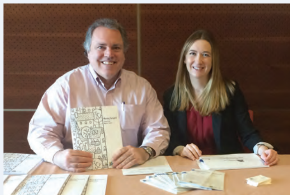
Staff at outreach event.