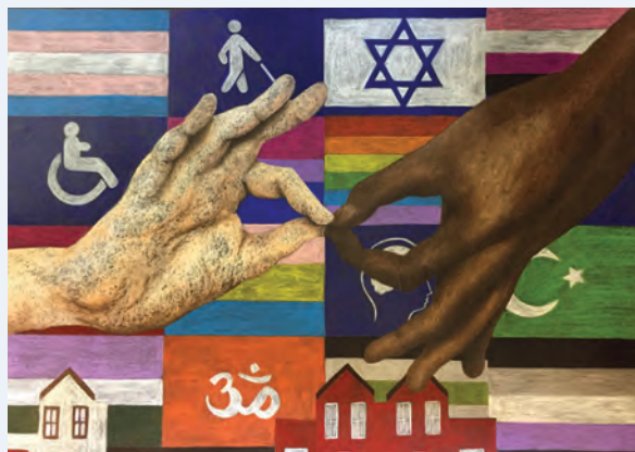
One of the winning submissions to our 2017 Fair Housing Poster Contest.